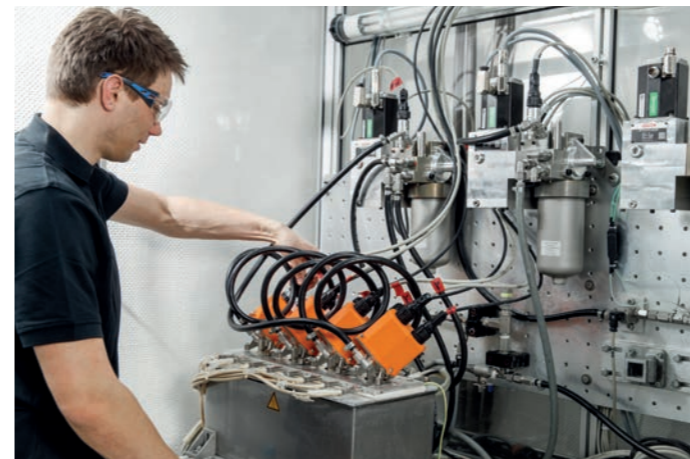
COMPONENT TEST BED

Urea injection for SCR catalytic converters and fuel injection systems for large engines have similar requirements: robust in design, precise in injection and atomization. The expertise of L'Orange in state-of-the-art fuel injection technology for large engines is now also available for exhaust gas after treatment: the new L'ONOX urea injection solution for SCR converters combines modular flexibility for a wide range of engines with a simple system architecture and a precise urea atomization without the need of additional compressed air.