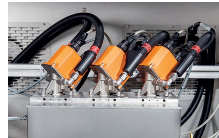
CLIMATE CHAMBER SETUP